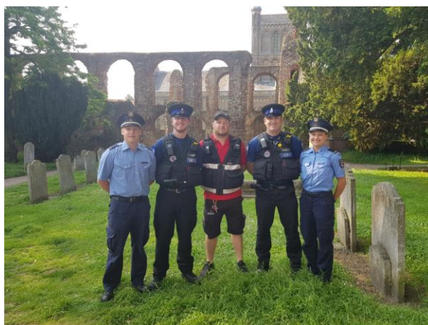
On patrol in Colchester with a local PCSO